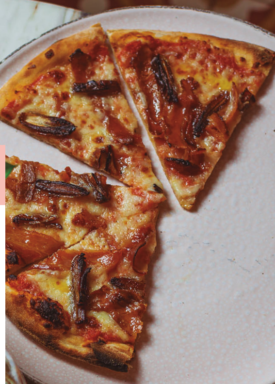
Bacon and dates

Basil, nuts, parmesan, bocconcini di Búfala, tomato confit and Serrano ham 44