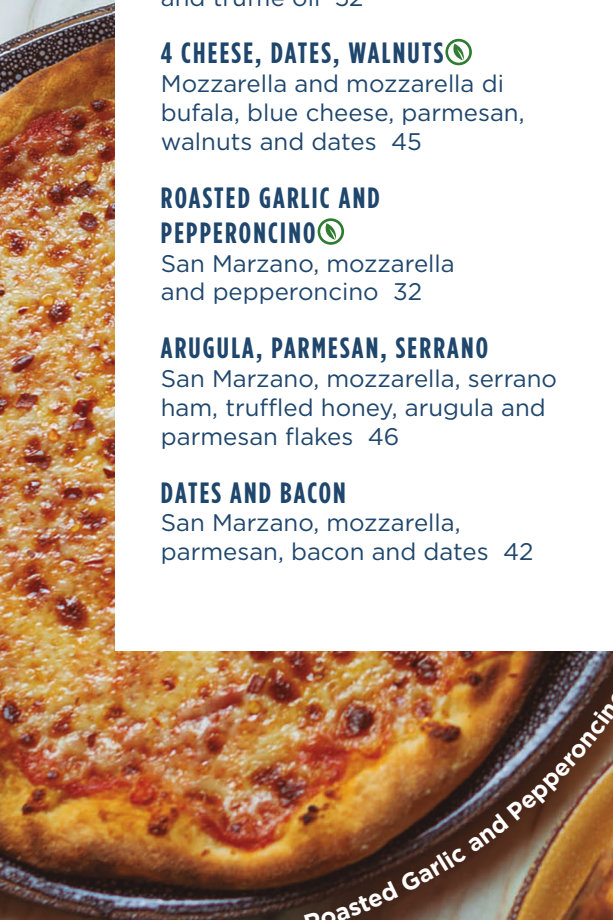
Roasted Garlic and Pepperoncino